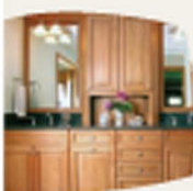
BATHROOM SHOWCASE INSIDE